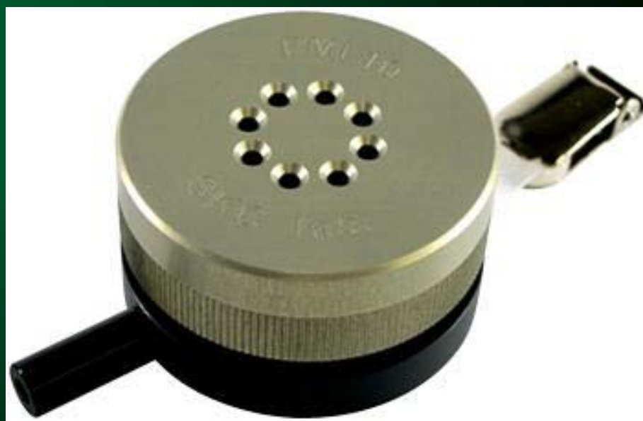
SKC PMI 225-350

The new SKC Personal Modular Impactor (PMI) also meets the requirements of IP-10A for PM10 sampling at 3 L/min.