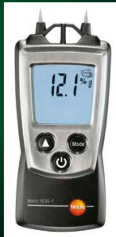
PocketPro Moisture Meter