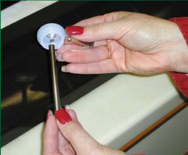
ULTRA I Design