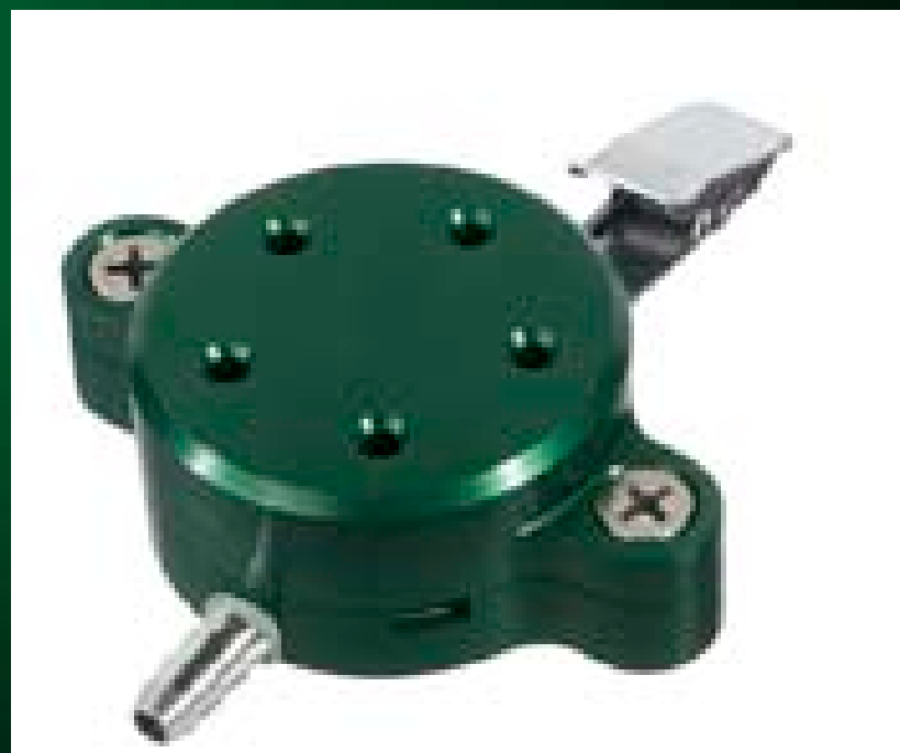
SKC PEM 761 Series