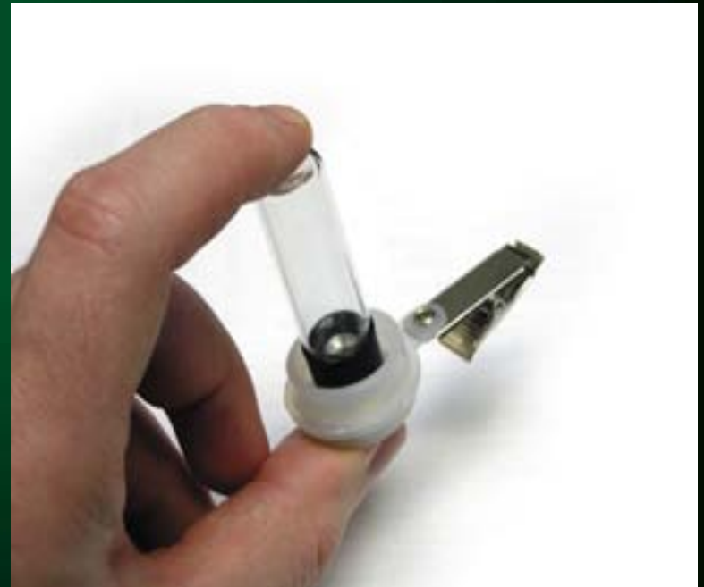
ULTRA II Design