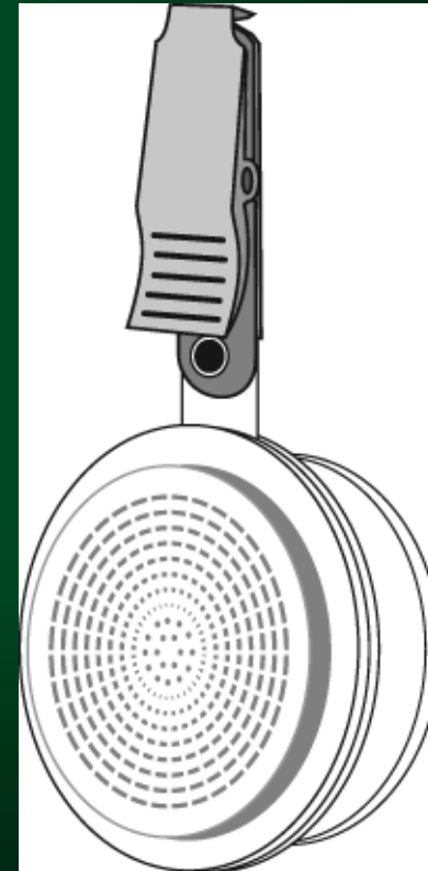
SKC ULTRA ® 590 Series

Since the 1990 publication of the Indoor Compendium, SKC has also developed a passive sampler for VOCs that uses thermal desorption and GC analysis.