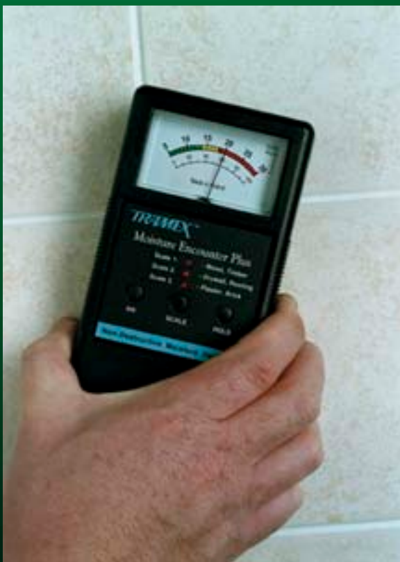
Pinless Moisture Meter