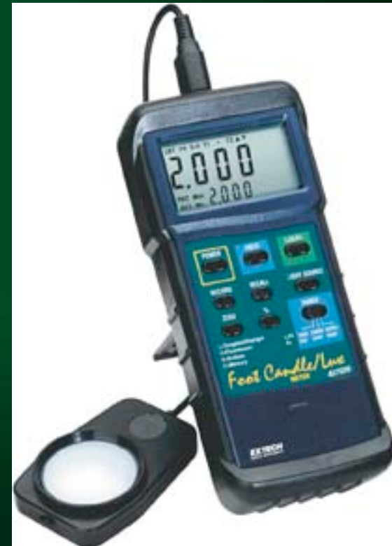
Light Meter SKC 753-003